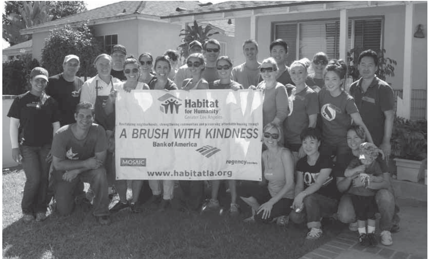
For the fourth year in a row, members of the South Bay Association of REALTORS® volunteered with Habitat for Humanity of Greater Los Angeles (HFH GLA) to renovate a home in the City of Los Angeles for a hardworking, low-income family. This “renovation day” was hosted by the South Bay Young Professionals Network (South Bay YPN). Two teams of 25 South Bay REALTORS® and HFH GLA Crew Leaders spent two days landscaping and adding sprinklers to the backyard. Seen here is the South Bay YPN team on Build Day.